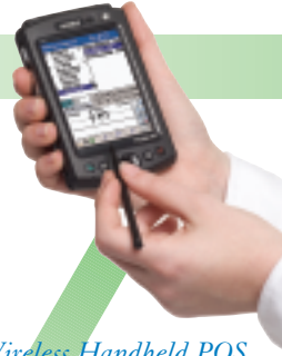
Wireless Handheld POS